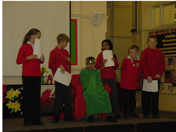
Crowning the Bard

Children begin to learn incidental Welsh when they are in the Nursery and a programme of teaching Welsh occurs throughout the school.